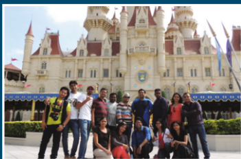
Foreign Educational Tours